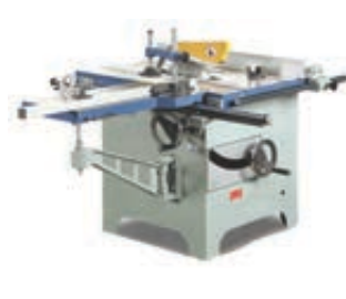
TILTING ARBOUR CIRCULAR SAW