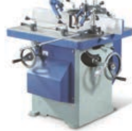
TILTING ARBOUR SPINDLE MOUDER