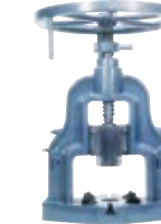
DOUBLE SIDED FLY PRESS