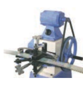
TEETH SETTING MACHINE