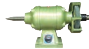
GRINDER CUM POLISHER