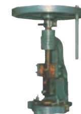
SINGLE SIDED FLY PRESS