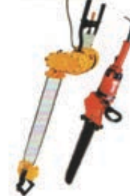
CHAIN SAW MACHINE