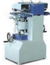
DOUBLE AUTO MOULD