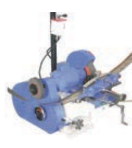
AUTOMATIC BANDSAW BLADE SHARPER