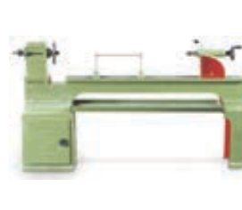
TURNING LATHE HEAVY DUTY