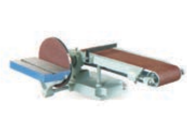
BELT & DISC SANDER