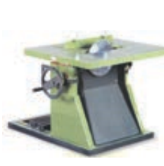
ADJUSTABLE CIRCULAR SAW